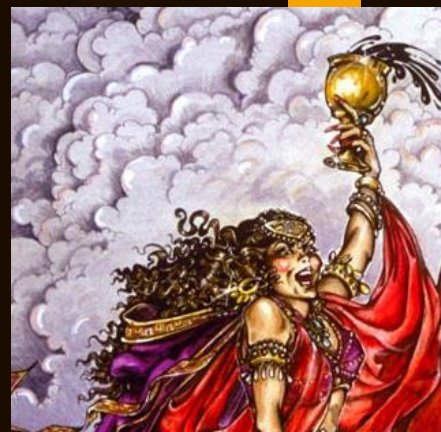
The Prostitute of Revelation 17 – 18