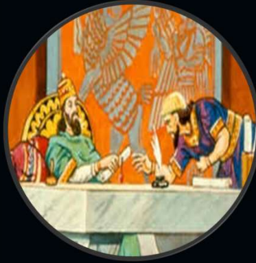
King Artaxerxes Grants Nehemiah's Requests To Rebuild The Walls.