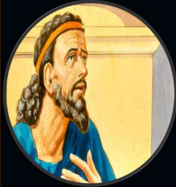
Nehemiah Makes His Request For Permission and Provision To The King.