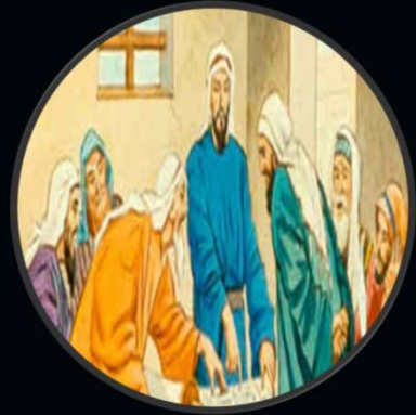
Nehemiah Returns to Jerusalem And Presents His Plans to Build.