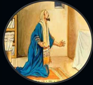
Nehemiah Prays To God For His Grace To Help