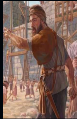
Nehemiah - Governor Of Jerusalem