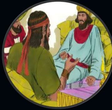
Nehemiah Hears About The Trouble In Jerusalem From Hanani