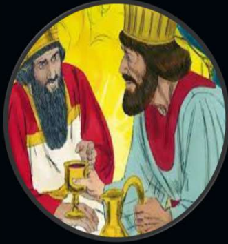
Nehemiah Serves As Cupbearer To The Persian King