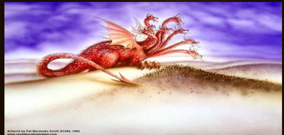
The Final Battle

Note: Gog and Magog: We should not ponder which powers/nations these are since the army was gathered from all parts of the world.