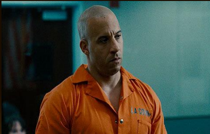
Vin Diesel as Dom Toretto

Fast and Furious (2009): "Dom's Sentencing"