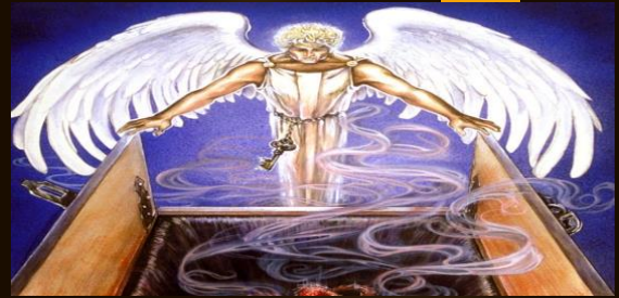
Satan Loosed From The Pit