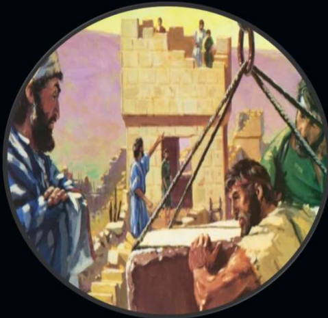
Nehemiah Enticed by Sanballat, Tobiah & Geshem To Leave the Work