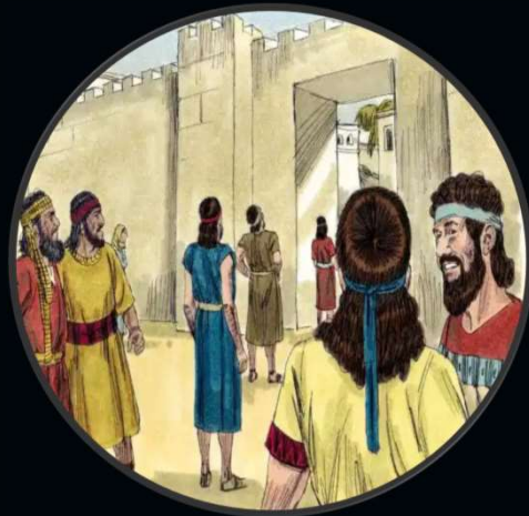
Nehemiah Completes The Building of Walls